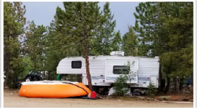
Water Storage "Pumpkin" in Silverton Northern